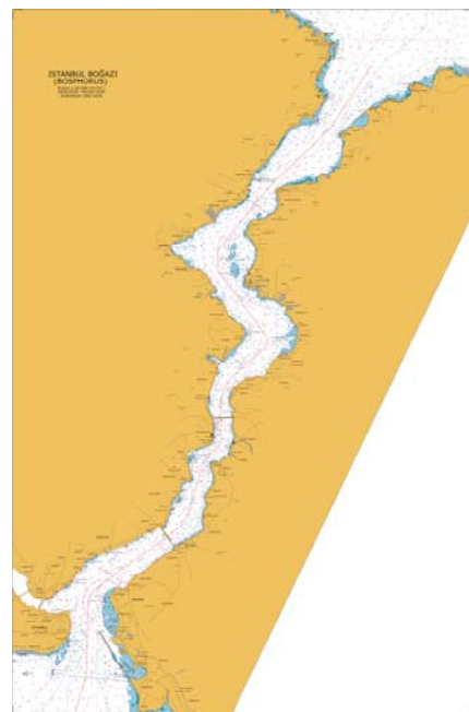
Figure 1: The Strait of Istanbul

In order to control and mitigate maritime accident risks and improve the safety of navigation in the described dire environment, The Bureau of Turkish Strait's Maritime Traffic Services (BMTS) has set up a sophisticated Vessel Traffic Control & Monitoring System (VTS) (covering not only the Channel, but also 20 miles into the Black Sea and the Sea of Marmara) and has established and effected a set of stringent Maritime Traffic Rules and Regulations (which will be denoted by R&R). The vessels arriving at the northern and southern entrances of the Strait of Istanbul enter and then navigate through the Channel according to the directions of the BMTS, which are based on the VTS inputs and the R&R.