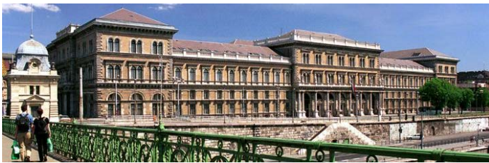
CORVINUS University of Budapest

ECMS 2017 is hosted by two Universities in Budapest: