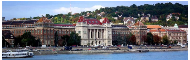
Budapest University of Technology and Economics