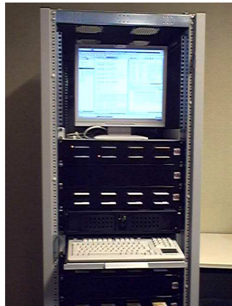
Fig. 2. The Java Card Grid platform.

The software framework that we have designed and implemented comprises two layers: a low level layer that handles the PCs, the readers and thus the smart cards, and a high level layer that manages the distributed computing framework that we offer. This framework makes it possible to have codes deployed on the cards. It also makes it possible for these codes to communicate with each other. It is basically a distributed grid-like system, supplemented with all the built in security features of the Java Cards.